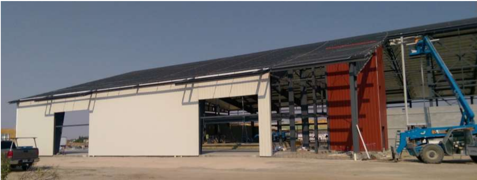
Exterior Siding at New Addition