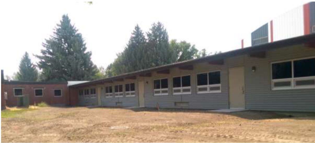
Exterior Siding and New Windows at Elementary