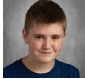
KEAGON 8TH GRADE