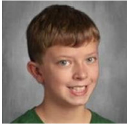
COLTER 5TH GRADE